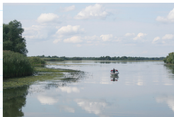
AREA OF ECOLOGICAL RESTORATION IN THE DANUBE DELTA, ROMANIA.

Lower Danube River Green Corridor (LDGC) by restoration projects for 225,000 ha and designation of new protected areas of 160,000 ha besides existing protected areas of 775,000 ha (including Danube Delta) for nature conservation. Since Romania and Bulgaria have joined EU in 2007, the process of designation of protected areas has been speeded up, including Natura 2000 sites in the common border areas (a number of 144 sites are SCIs and 91 are SPAs). The protected areas designated by the end of 2008