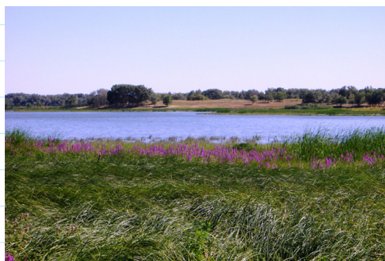
FLOODPLAIN IN DE VOLGA-DON CATCHMENTS, RUSSIA.

The Tuzlov River basin is a part of the River Don catchment basin, its area is 4680 km 2 , including 4340 km 2 in the Russian Federation and 340 km 2 in Ukraine. The basin is situated on the territory of six administrative districts of Rostov Oblast and is one of the most lived-in and economically developed part of the Oblast, it has a good net of transport ties that contributed to its economic development. In the process of the comprehensive survey materials analysis main water/economic problems of the Tuzlov River basin have been identified: