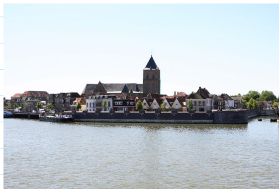
IJSEL RIVER WITH WATERFRONT OF THE KAMPEN CITY, THE NETHERLANDS.

Throughout Europe the ever increasing intensity of use of rivers and their floodplains for the benefit of mankind has resulted in a widespread physical, morfological, chemical and biological deterioration of aquatic and riverine habitats. The relationship between culture and nature needs a rebalancing by wise use and interventions to restore, renew and innovate the qualities of a river, basin wide. And for that reason river restoration appears to be more an art than a science. Ecological river restoration focuses on regaining lost ecological functions, contributing to biological diversity and as such in many respects, to the human society itself. River restoration, including stream and floodplain restoration on a basin scale can support species recovery, improved inland and coastal water quality by means of sediment particle retention and associated nutrients and pollutants during flooding making use of natural ecological processes in the riverine environment, the development of new habitats for wildlife, while promoting alternative human activities like recreation. Ecological restoration is necessary due to all interferences that took place in the past or still takes place at present, but most important is to conserve and protect the remaining natural river and wetland ecosystems on our globe.