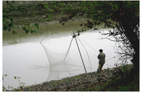
JIIA RIVER WITH LOCAL FISHERMAN, ROMANIA.