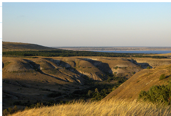
SOIL EROSION IN THE VOLGA-DON RIVER CATCHMENTS, RUSSIA.

The Plan contents comprise the following principal sections: