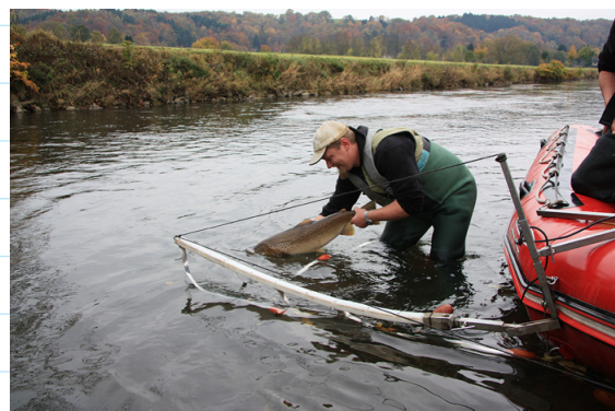
SAMPLING OF THE NATURAL SALMON REPRODUCTION IN NORTH-RHINE-WESTPHALIA, GERMANY.

The International Commission for the Protection of the River Rhine (ICPR) has chosen the salmon as a flagship species for ecological rehabilitation (salmon 2000). After a prolongation, this Rhine Action Programme (RAP) is now scheduled until 2020 and ecological rehabilitation is integrated into the efforts of the Water Framework Directive to reach the good ecological status of running waters in the Rhine basin. In 1988 the first juveniles were released into the River Sieg, a tributary of the River Rhine, in North-Rhine-Westphalia. In 1990s, the first adult salmon returned to this river and the first natural