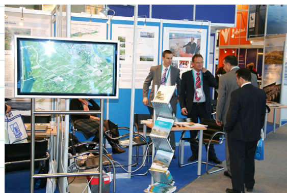
PRESENTATION OF THE DUTCH IJSEL BY-PASS PROJECT KAMPEN AT THE WORLD WATER FORUM 2009 IN ISTANBUL, TURKEY.

The River IJssel in the Netherlands is a major branch of the River Rhine, the 3rd largest river of Europe. It discharges into the Lake IJsselmeer. The IJsseldelta is a low-lying area that is threatened by floods from both the river IJssel and from the Lake IJsselmeer. Several major spatial developments are planned in the IJsseldelta in the coming decades. The municipality of Kampen has planned some 4000 houses, a new railway line (the Hanzelijn) is being constructed at the moment and two highways (N50 and N23) will be reconstructed in the area. Furthermore, a river bypass is foreseen as one of the international measures to