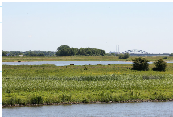
REHABILITATION OF A SECONDARY GULLY IN THE FLOODPLAIN VREUGDE-RIJKERWAARD ALONG THE RIVER IJSSEL, CLOSE TO THE CITY OF ZWOLLE, THE NETHERLANDS.