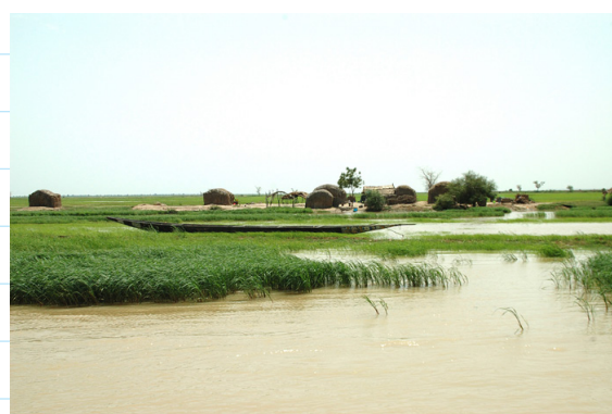
LOCAL COMMUNITY CLOSE TO THE CITY OF MOPTI, MALI, AFRICA.

objective approach through a range of strategies, including partnership with the development sector and use of innovative finance mechanisms. With specific knowledge it is possible, for example, to provide incentive mechanisms that reward local communities in sub-Saharan Africa for conserving and restoring river ecosystems that support wintering water bird communities that are highly valued in Europe as breeding birds. This “biorights approach”, variant of “payments for ecosystem services” enables local communities to develop new, alternative livelihoods while maintaining and restoring globally valued nature.