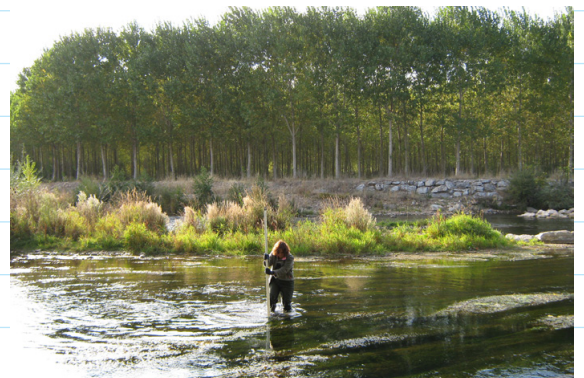
SURVEYING THE ORBIGÓ RIVER, SPAIN.