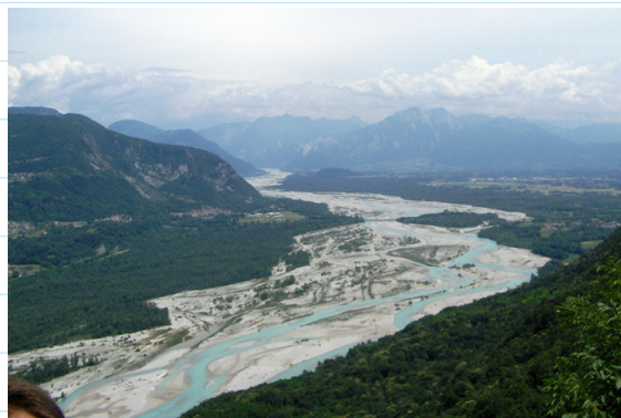
TAGLIAMENTO RIVER IN ITALY, A RIVER RESTORATION REFERENCE.

Initially the river restoration was guided by the Ramsar Convention for wetlands and the Convention on Biodiversity. But in the meantime, there are a number of EU Directives that are very supportive to river restoration. Especially, the EU Water Framework Directive (WFD) and the Bird and Habitat Directive (B&HD). The Natura 2000 sites are quite specific in this context. Although these directives require a minimum level with respect to the ecological conditions, ecological river restoration is making use of these directives for the ecological restoration of the river ecosystem as an integral part of integrated river basin management (IRBM). It might be clear that there are considerable regional differences in the approach of river restoration, due to the different river characteristics as well as in the past as in the present.