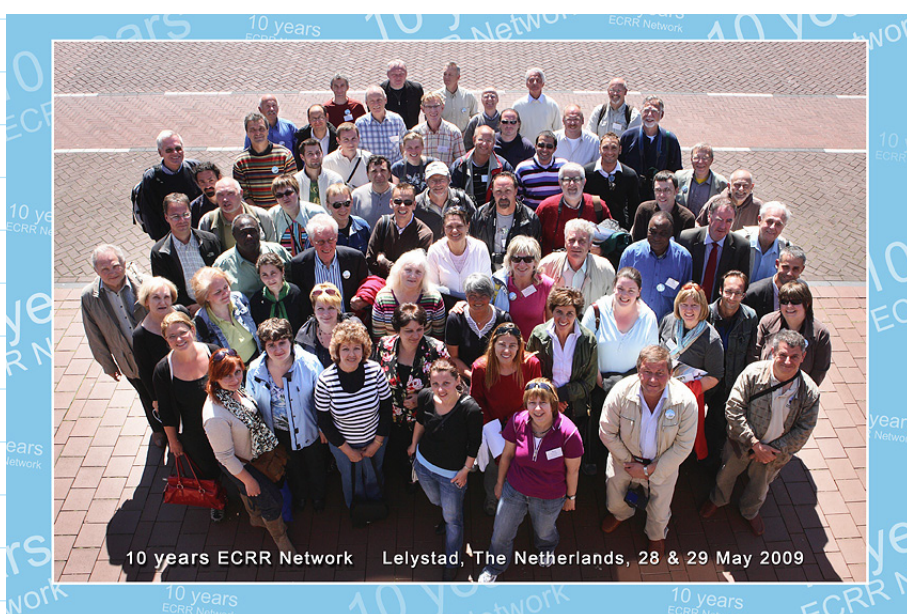
PARTICIPANTS OF THE ECRR SEMINAR IN KAMPEN, THE NETHERLANDS.

The European national governments ensure their international credibility by applying an ecosystem approach to manage their rivers on a basin scale, in particular the transboundary rivers, in addition to the integrated river basin management approach and use the opportunities to address ecological river restoration and conservation within the implementation plans of the EU Directives.