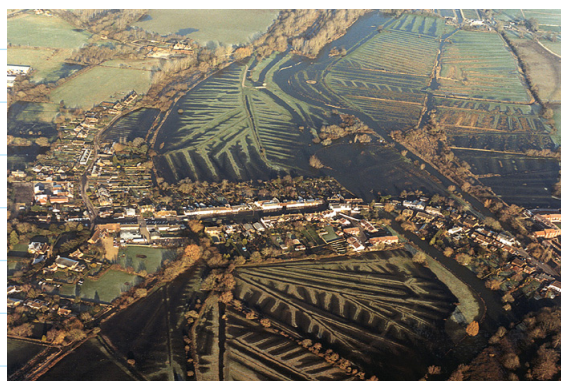
THE RIVER AVON - A CLASSIC CHALK RIVER CATCHMENT IN THE UNITED KINGDOM.

While the classic chalk stream landscape in England is considered to be one of the most attractive natural feature of the English countryside, it is in fact the result of intensive human management over many hundreds, even thousands, of years. Any initiative attempting to manage and reinstate particular interest features must recognize that this is an artificial environment and that its status and appearance at any particular time is the result of a wide range of past and present management actions.