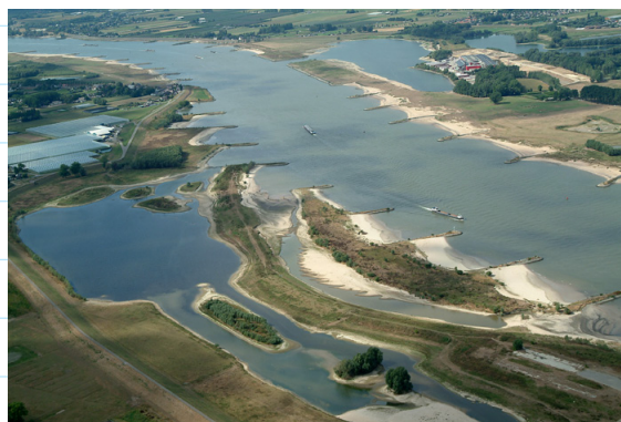
ECOLOGICAL RESTORATION OF THE LANDSCAPE IN A WAAL FLOODPLAIN NEAR GAMEREN, THE NETHERLANDS.

mono-focal river management practices, and of the increased benefits of a healthy, multifunctional river system for society. During their planning phase, river restoration projects typically use some form of information on historical or contemporary reference conditions to define objectives and to help the evaluation process. As such there are often no appropriate reference systems to use. Ignorance of regional land use and river history can lead to restoration that sets unrealistic goals. Hydrologic connectivity refers to water mediated transfer of matter, energy and organisms within or between components of the river environment- the aquifer, floodplain, river bed etc. Connectivity operates in longitudinal, lateral and vertical dimensions and over time. In general the vision of river restoration is simple and practical. River restoration takes into account the historical situation-both physical –morphological and natural in relation to human activities- and aims to preserve and capitalize the remaining natural values, in the context setting of socio-economic developments towards a more sustainable approach. The high investment costs in ecological restoration are not realistic in economic sense, as natural values are poorly expressed in money equivalents.