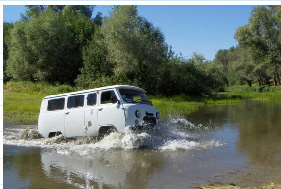
AKHTUBA FLOODPLAIN OF THE VOLGA RIVER CLOSE TO THE CITY OF VOLGOGRAD, RUSSIA.